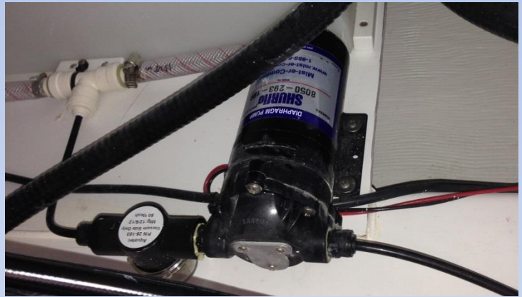
Typical Pump/Strainer/ADV installation