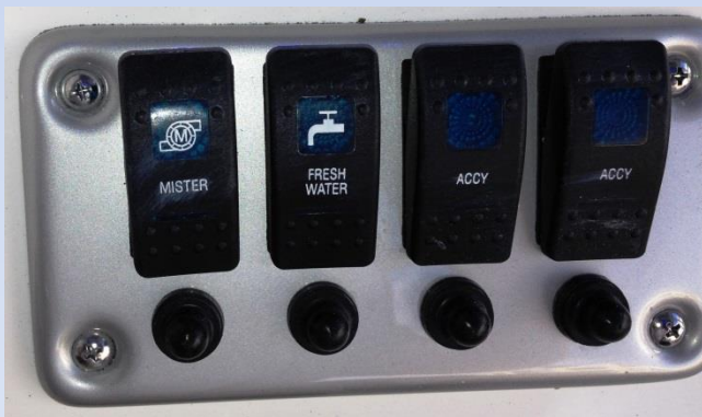
Misting System switch