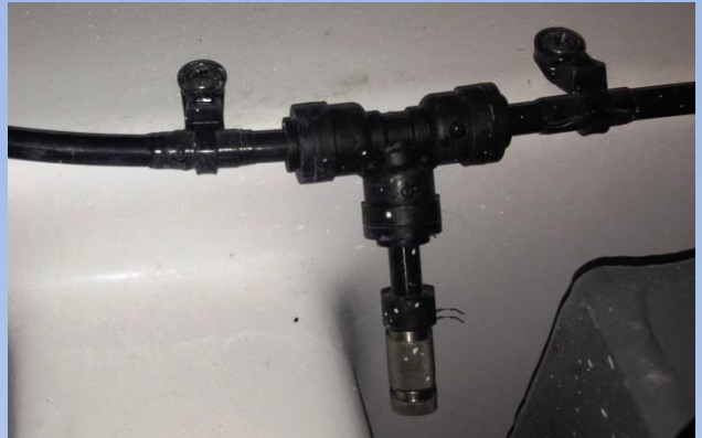
Typical Automatic Drain Valve (ADV) installation