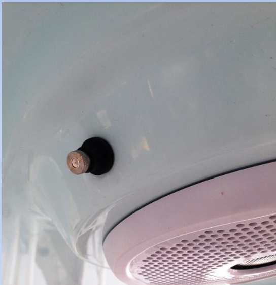
Evenly space misting heads